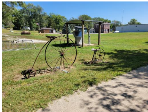
The silo trailhead/camp area at Coin

Wabash Weekend bike trek was September 2 nd and 3 rd . This is a beautiful ride from the Wabash Trace Trailhead in Council Bluffs, Iowa through the Loess Hills to Shenandoah, Iowa. Rhonda Hall and I enjoyed the roughly 50 mile ride along the beautiful trail through wooded areas and some open spaces. Even though the weather was hot, the wooded areas helped shade us and block enough of the wind to keep us cool. We saw the derailed train cars, wrecked in the 1960's, at the West Nishnabotna River crossing. We had a nice conversation with couple fellow trail riders at the silo trail rest/camp stop by Coin. The stop includes a silo made into a restroom/shower facility, areas for tent camping and bike "statues". Silver City has a very nice bike shop, the Happy Trails Cycle, where we had snacks and a great conversation with the owner. The first day's ride ends in Shenandoah where we stayed the night at the Isaak Walton cabin. Rick Stein had supper for us. The second day we had lunch in Malvern.