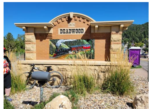
The end of our fantastic ride!