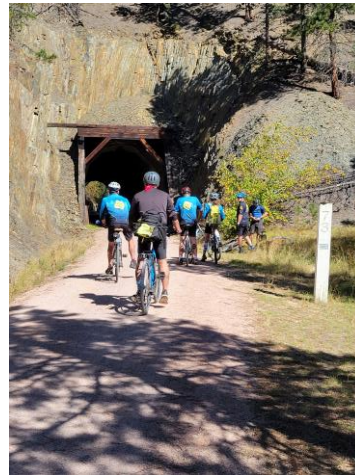
One of several tunnels on the Mickelson Trail