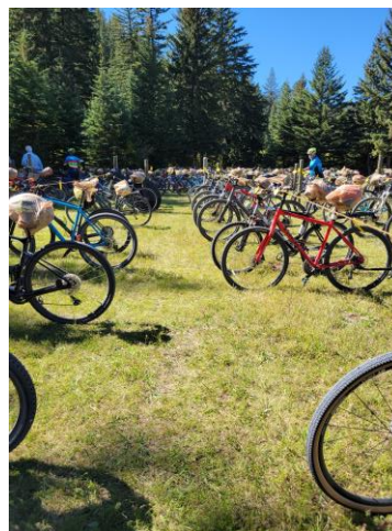
Our bikes, ready for the night, in the meadow in Rochford