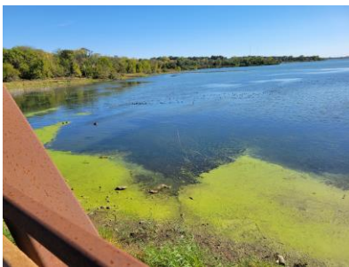
There were lots of geese