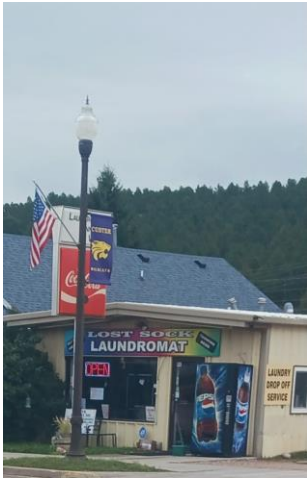
We couldn't resist a picture of the Lost Sock Laundromat.