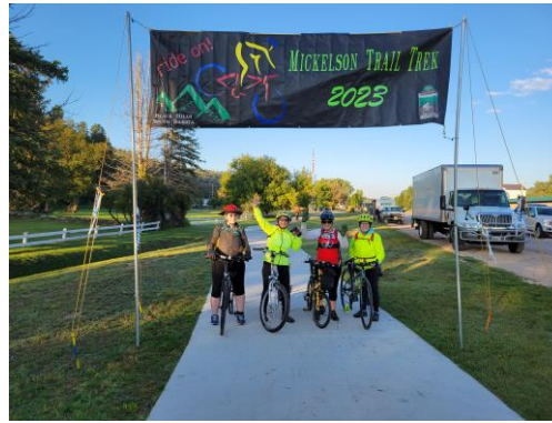
The first day beginning: Custer to Edgemont