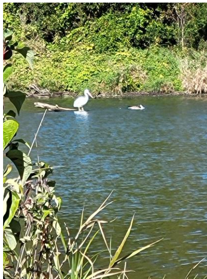
There was a pelican with a goose on the lake