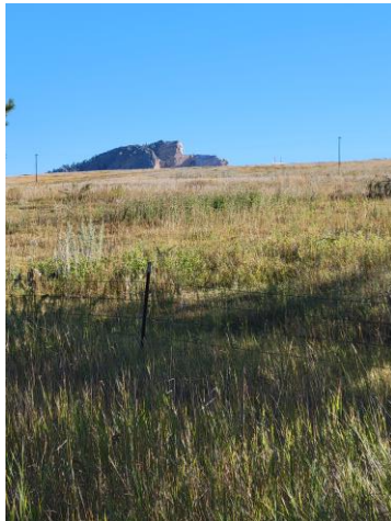
The Crazy Horse Monument viewed from the trail