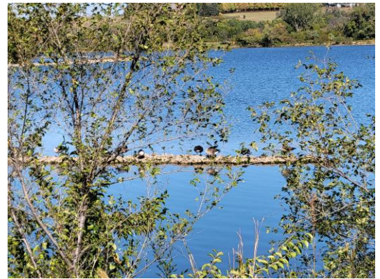
Geese lounging on a sand bar