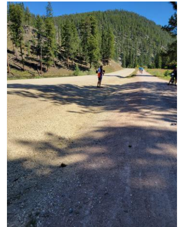
You never know who you'll see on the trail. This man is playing bagpipes.