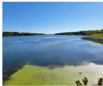
A view of the lake from the north bridge

Do you have great biking experiences to share?